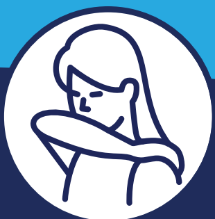
Touse nan koud ou (kwen bra w)