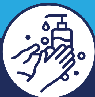
Lave men w