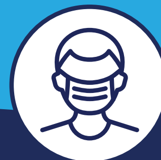
Kouvri figi ou